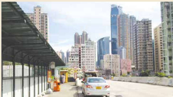
* 荃灣港鐵站上落客點站為大河道北南行停車灣 Boarding point of Tsuen Wan Station at Dai Ho Road North southbound