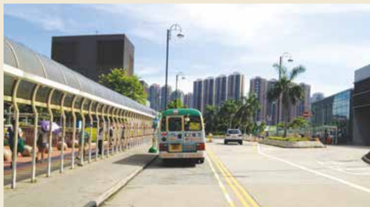
# 荃灣西鐵路站上落客點站為大河道 (西鐵站D出口對面公共小巴士站) Boarding point of Tsuen Wan West Station at Dai Ho Road (Minibus Stop at the opposite to Exit D)