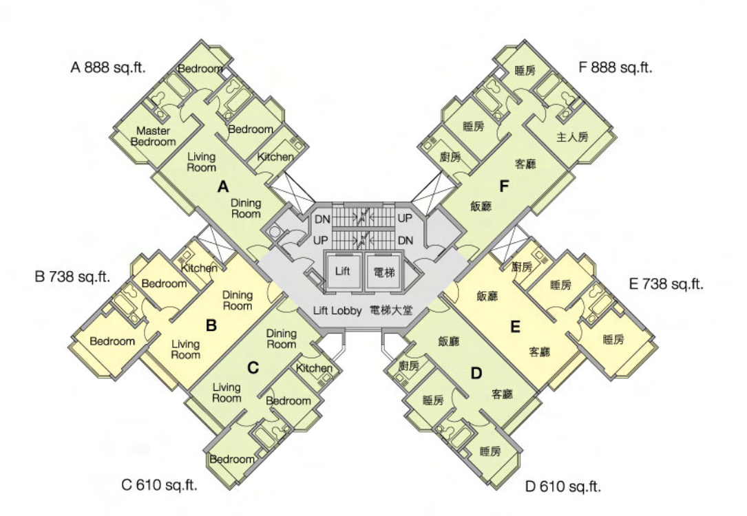
2-3 bedrooms sea view apartments (610sq.ft. -888sq.ft.)