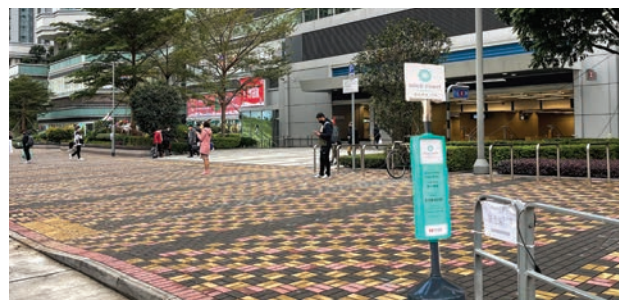
南昌站之上落客點為港鐵南昌站近A出口 Boarding point of Nam Cheong Station at MTR Nam Cheong Station near Exit A